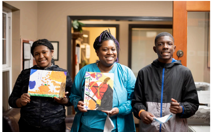
Paint night at the Tacoma Rescue Mission for families experiencing challenges.

KBTC celebrates the diversity of our community by spreading awareness through trusted and credible information that illuminates paths to social discourse.